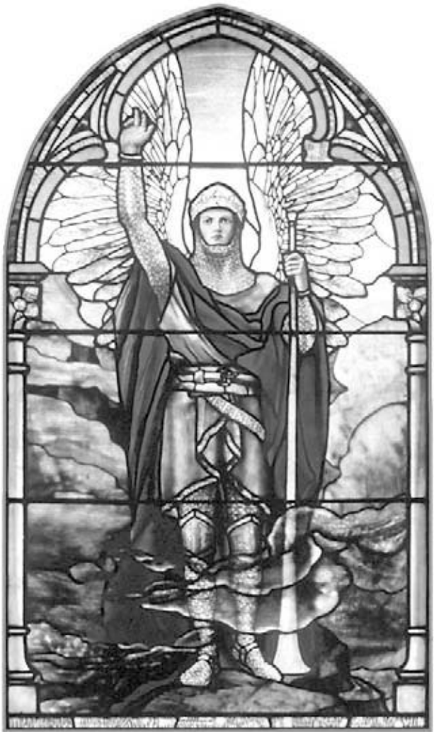
ARCHANGEL GABRIEL, MESSENGER OF GOD